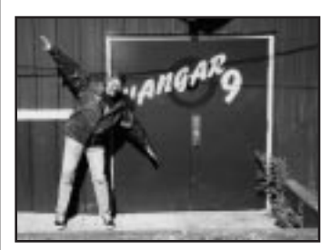
Let Me Take You Down

A WIDB alumnus scours Illinois Ave. for his lost youth in this revealing pictorial