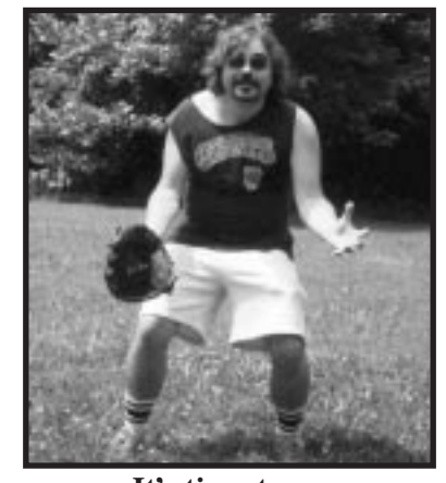
It's time to go back-back-back-back to Carbondale for the 30th Anniversary Reunion, June 23rd, 24th & 25th