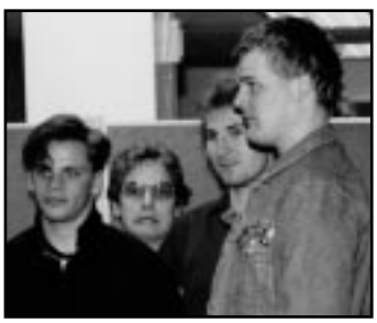
All Lined Up

Whose mugs made the SIU Campus Police Dept.'s Mug Shot Wall Of Shame? A&F has all the details.