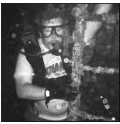
THE BIG GUY DIVES FOR TREASURE TO PAY FOR HIS TRIP TO REUNION